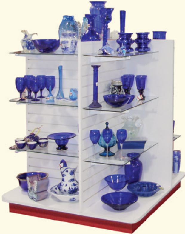
54" High x 48" Wide x 48" Deep