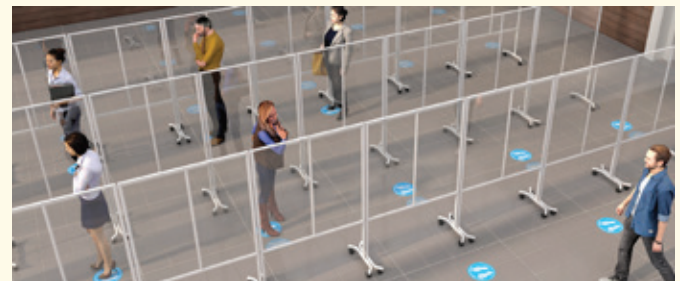
Easily assembled acrylic barriers can be easily snapped together to create large protected areas.