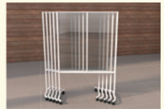
Nest shields for storing.