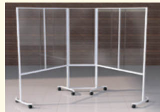
Create multiple configurations