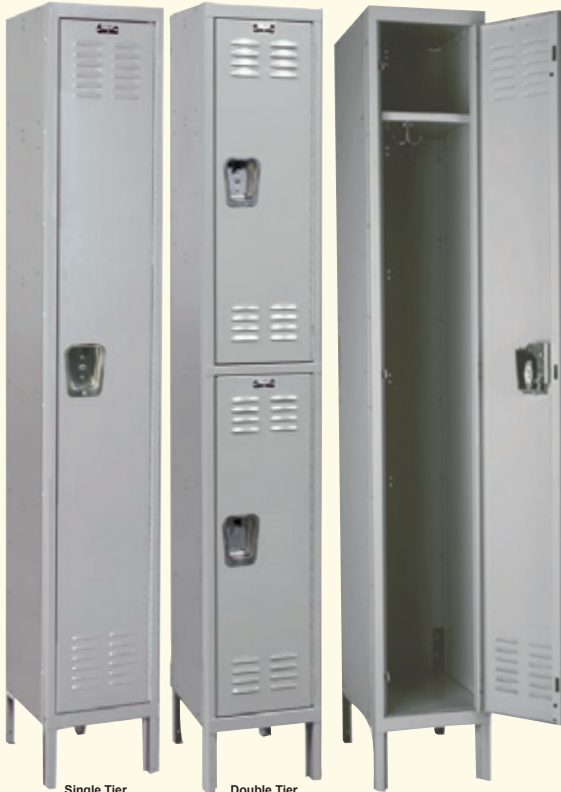
Single Tier, 1 wide, 1 opening

Specially formulated MedSafe Antimicrobial powder coating finish protects against bacteria, microbes & mildew for up to 20 years! It is ideal for a variety of settings such as healthcare facilities, athletic facilities, schools, day care centers, senior care communities, residential housing, hospitality settings and cruise ships.