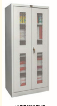
VENTILATED DOOR CABINET