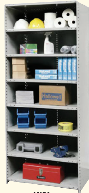
8 SHELF CLOSED STARTER UNIT