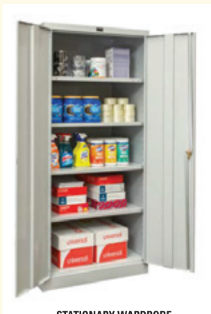
STATIONARY WARDROBE SOLID DOORS