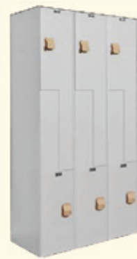
Z-Tier, 3 wide, 6 openings