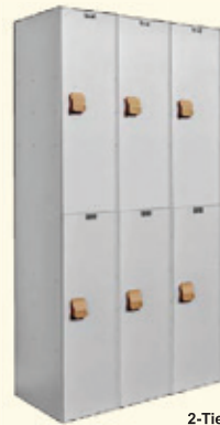
2-Tier, 3 wide, 6 openings