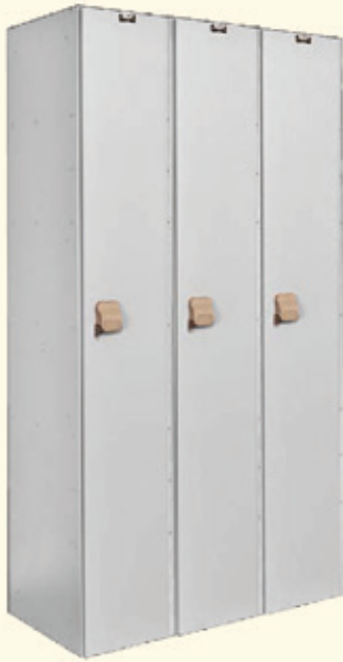
1-Tier, 3 wide, 3 openings

HOOKS: 2 single-prong hooks in single and double tier lockers