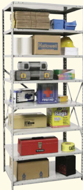
8 SHELF OPEN STARTER UNIT

+ ANTIMICROBIAL PROTECTION FOR OVER 20 YEARS!