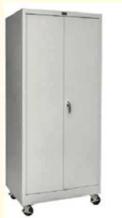
MOBILE STORAGE SOLID DOORS