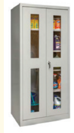
STATIONARY COMBINATION SAFETY-VIEW DOORS